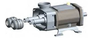
4. Exchange of mechanical seals