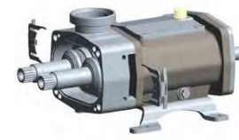
3. Unlocking of item keys