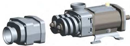
1. Removal of pump casing and cover

The entire procedure requires only a few moments and can be carried out without great technical effort.