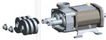
2. Removal of screws